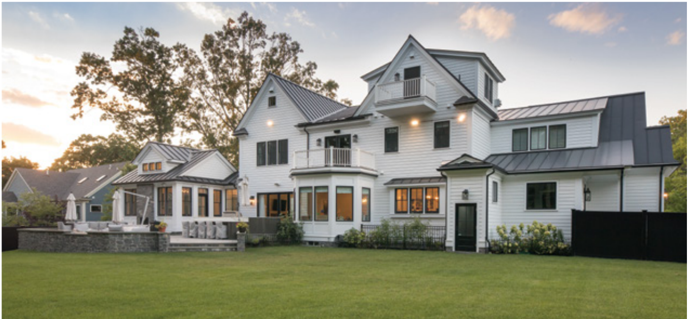
The back of the house has a big patio and plenty of space for entertaining and for the children.