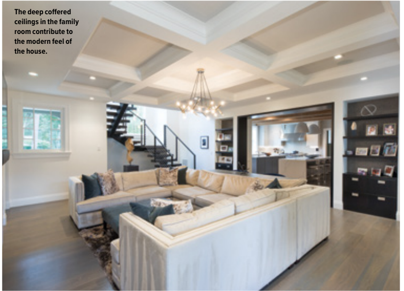
The deep coffered ceilings in the family room contribute to the modern feel of the house.