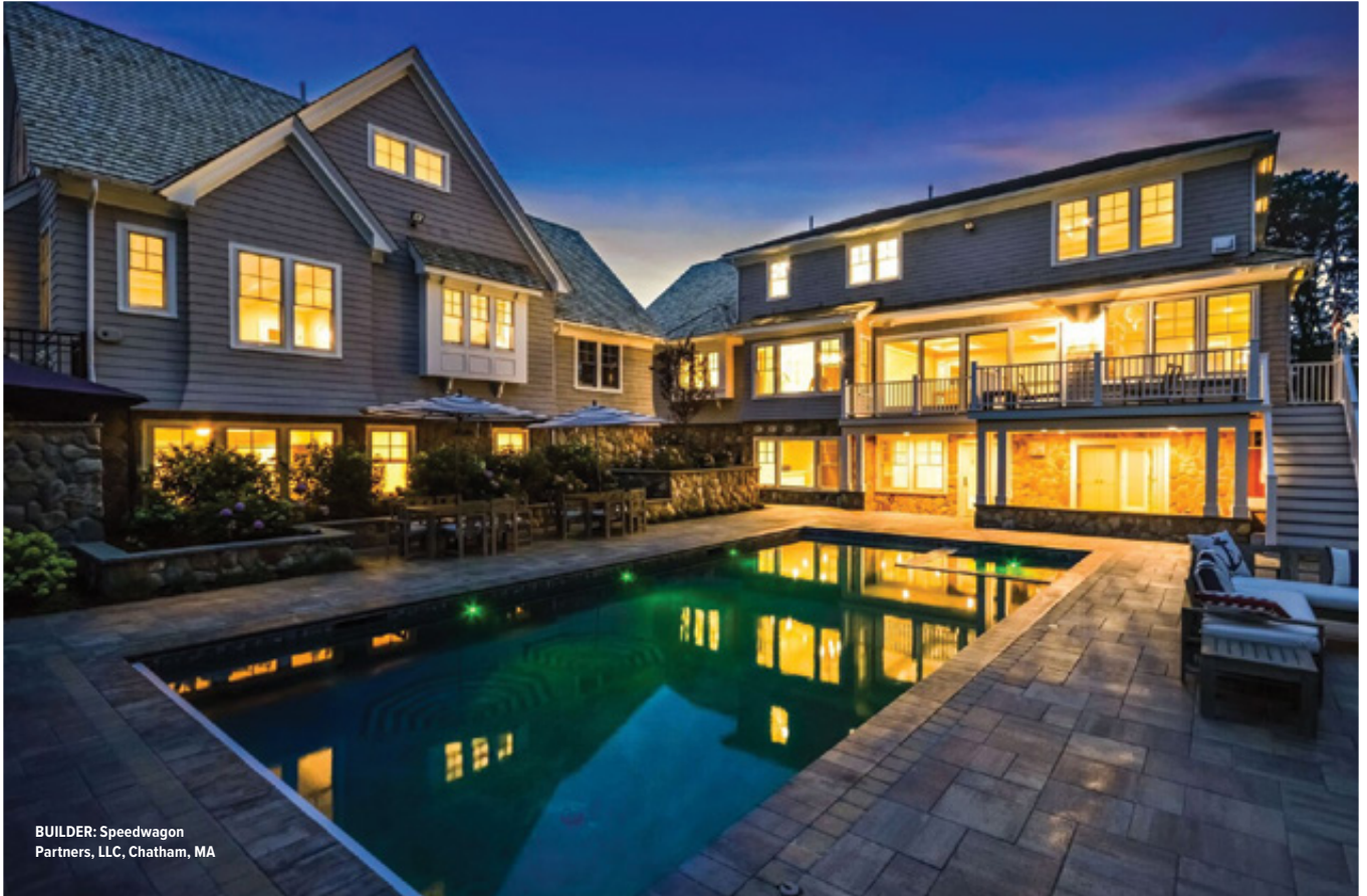
BUILDER: Speedwagon Partners, LLC, Chatham, MA