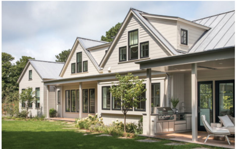
Enjoy the outdoor fireplace over the Edgartown Harbor anytime of day or evening.