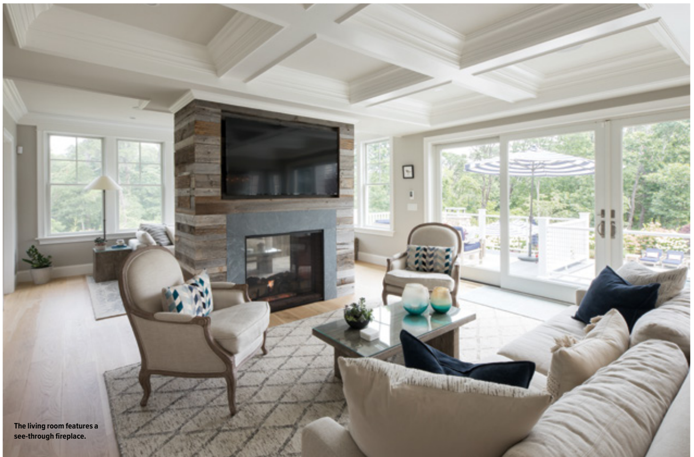
The living room features a see-through fireplace.