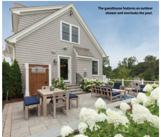
The guesthouse features an outdoor shower and overlooks the pool.