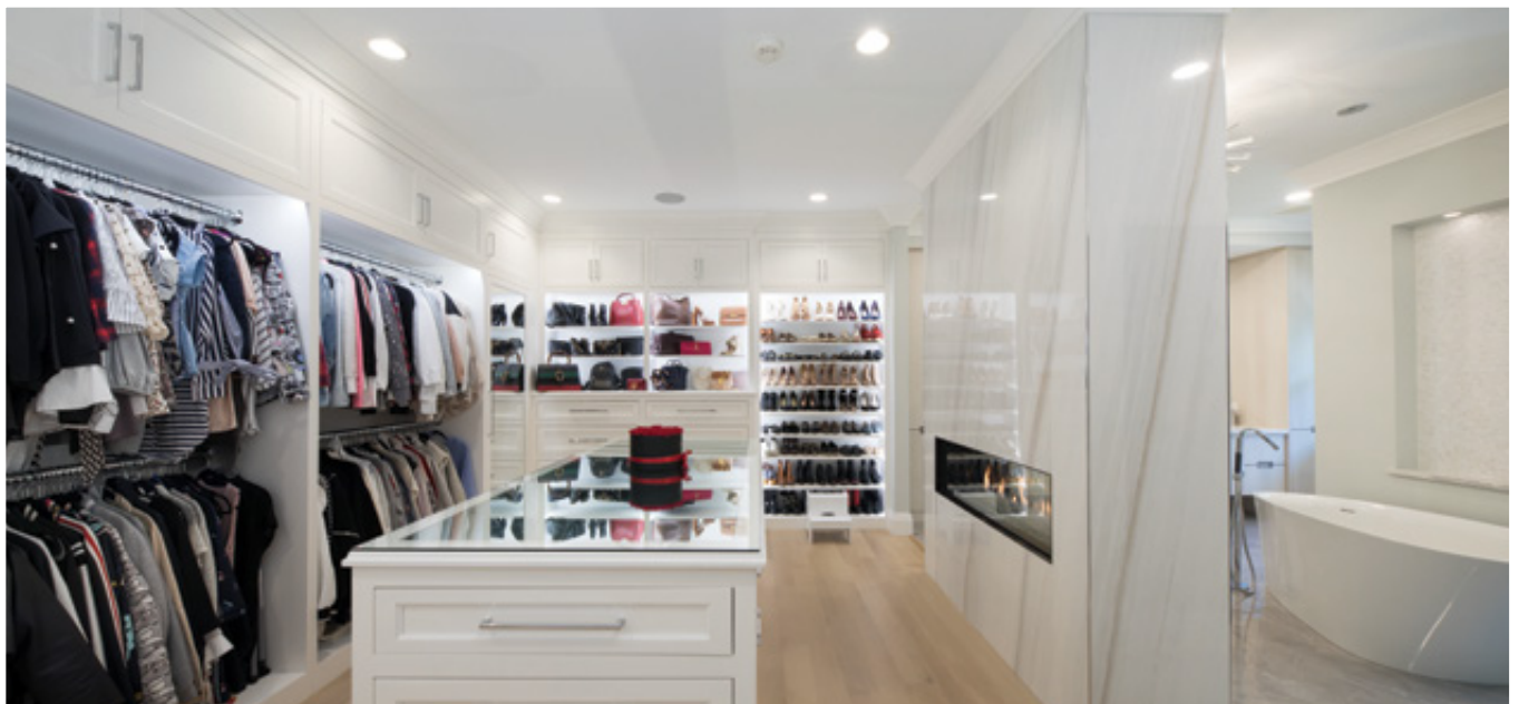
Custom built closet by Speedwagon Partners, LLC