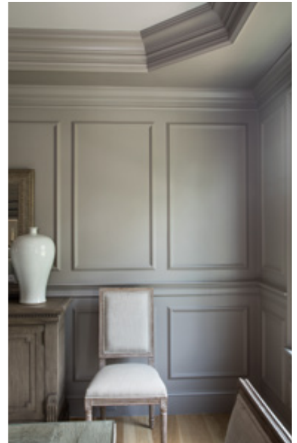
Excellence in quality and workmanship by Speedwagon's carpenters make each home an extraordinary one-of-a-kind home.