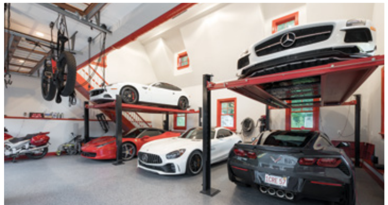
The garage is a misnomer; it's more appropriately labeled a showroom for the client's extensive car collection. "He wanted a dedicated space for all of his toys," detailed Jason.