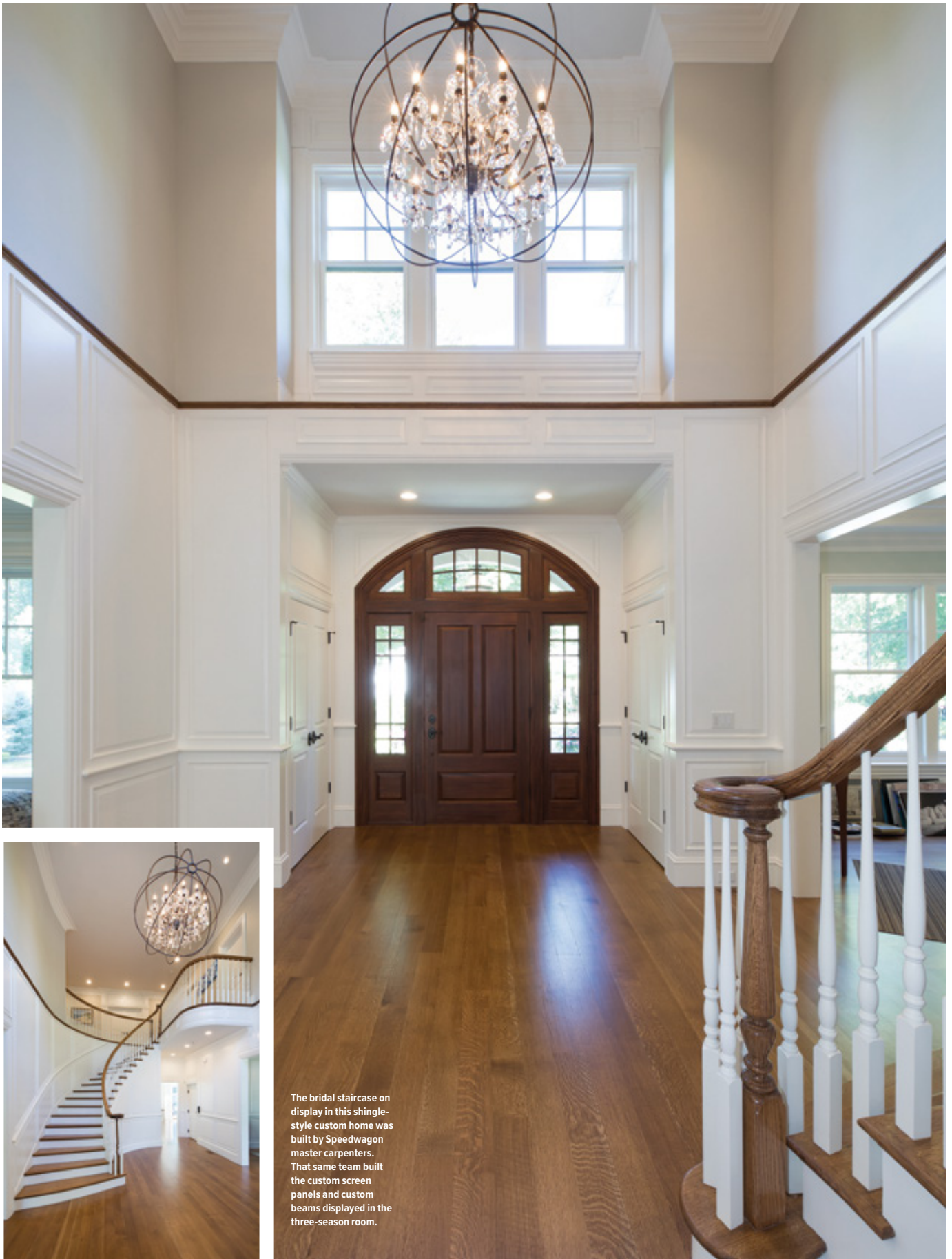
The bridal staircase on display in this shingle-style custom home was built by Speedwagon master carpenters. That same team built the custom screen panels and custom beams displayed in the three-season room.