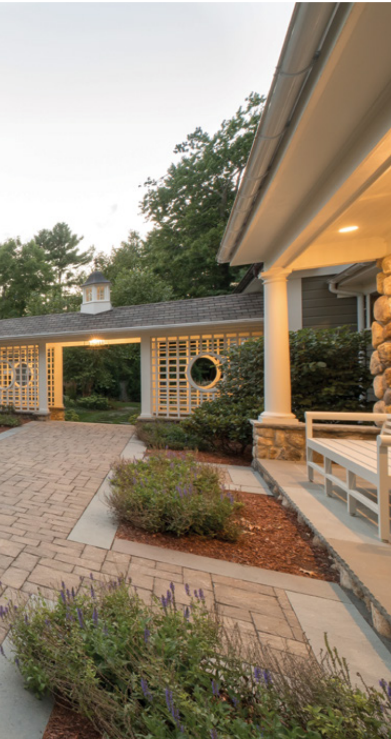
A great backyard for entertaining