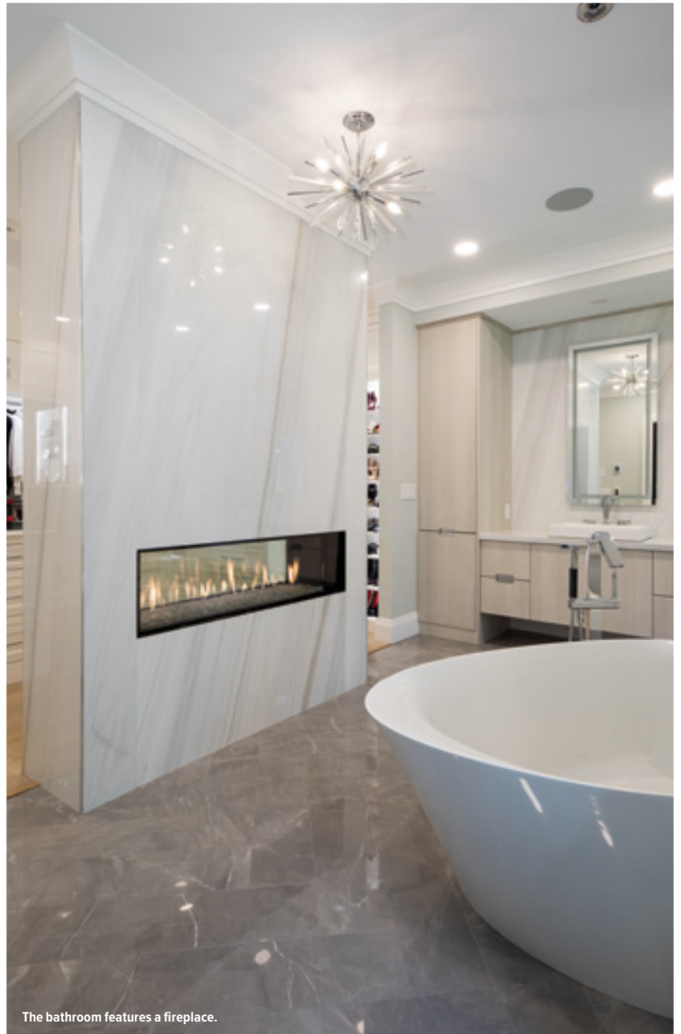
The bathroom features a fireplace.