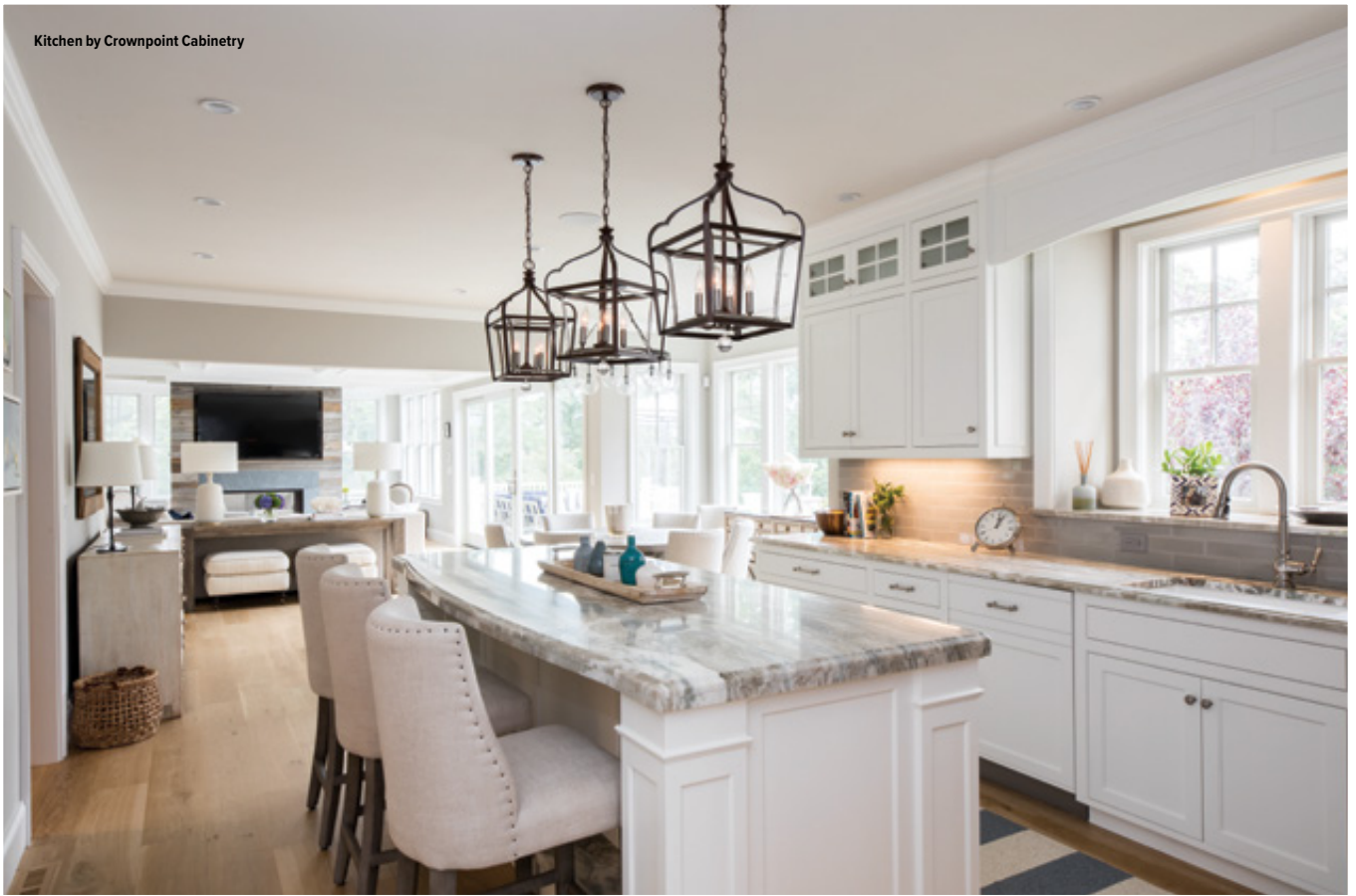
Kitchen by Crownpoint Cabinetry