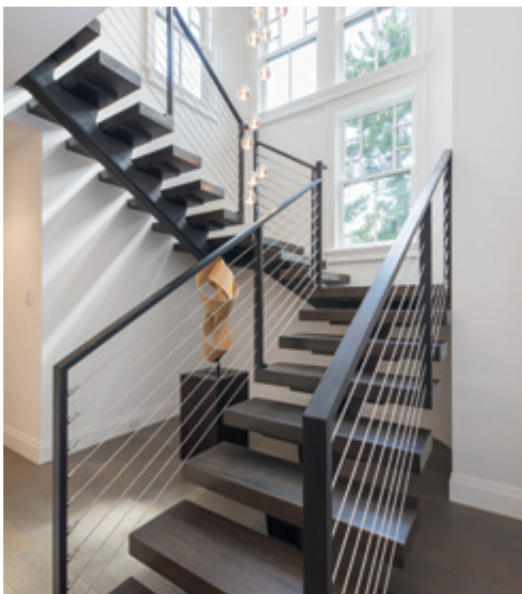
The central feature of the home is undoubtedly the floating steel staircase with steel rails and posts painted black and steel cables. Speedwagon Partners' in-house carpenters built the treads from walnut.