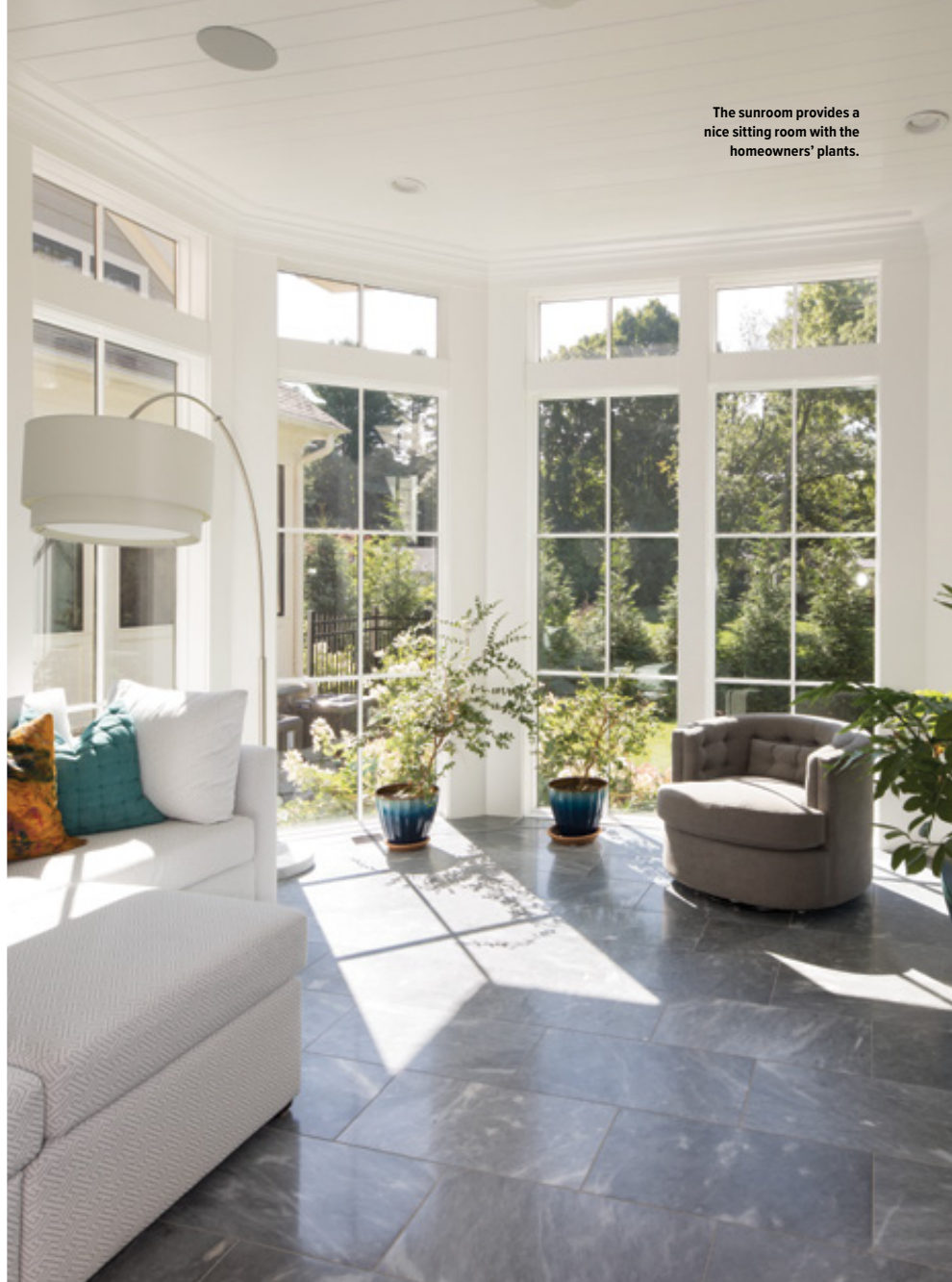
The sunroom provides a nice sitting room with the homeowners' plants.

the new homeowners, she seeks to interpret exactly how they intend to use their new space and what they might envision for it.