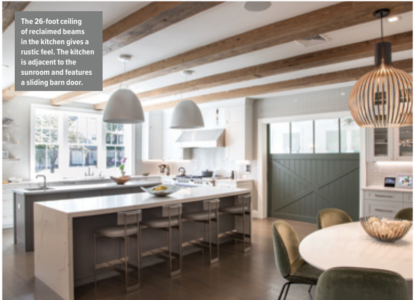
The 26-foot ceiling of reclaimed beams in the kitchen gives a rustic feel. The kitchen is adjacent to the sunroom and features a sliding barn door.